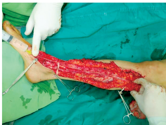
Fig. (2): Flushing the vein with heparin for thrombolysis and detection of any leak.