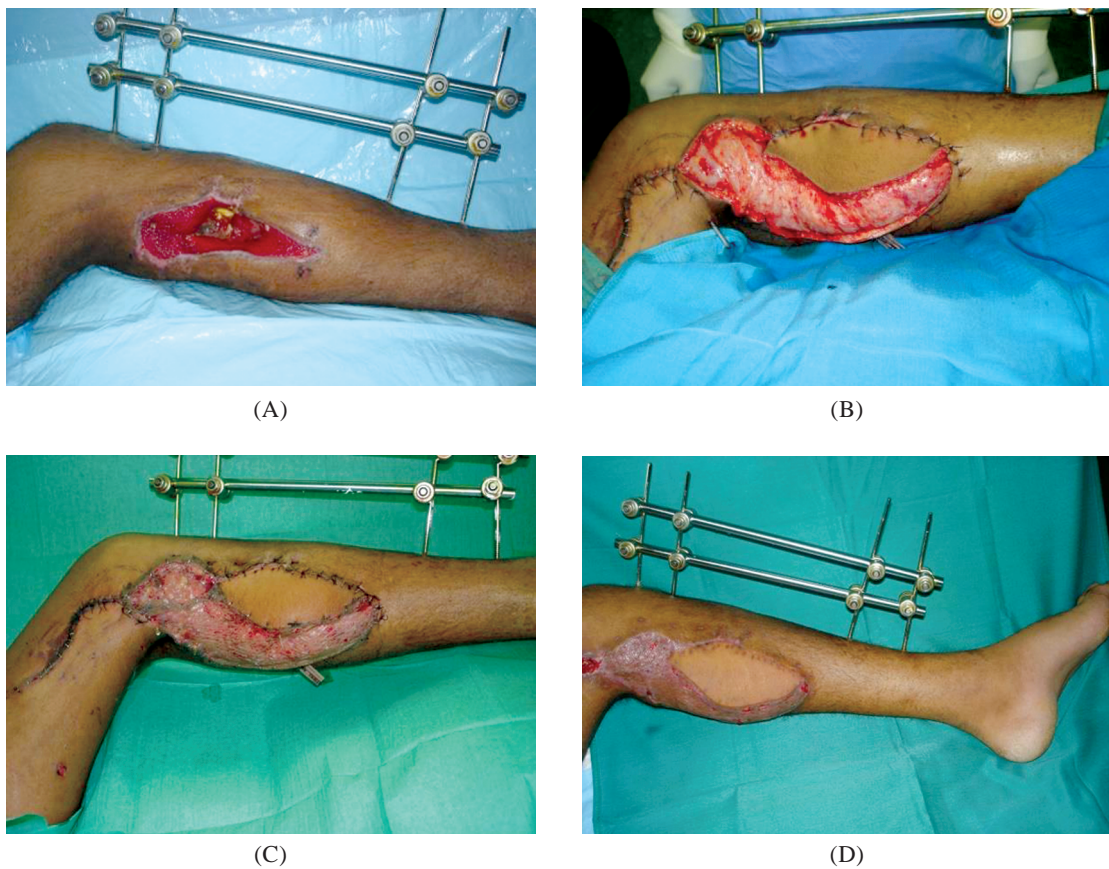
Fig. (6): Case (2): (A) Male patient 30 years old with a post traumatic fracture of right upper two thirds of the tibia with exposed plate, (B),(C) Immediately after the second stage of complete coverage with LD myocutaneous flap and STS graft (D) One month later. Following reconstruction by LD flap in a second stage.