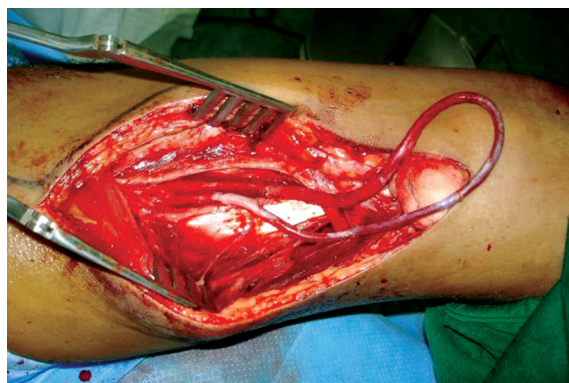
Fig. (3): The constructed loop after anastomosis to the femoral vessels (artery and vein).