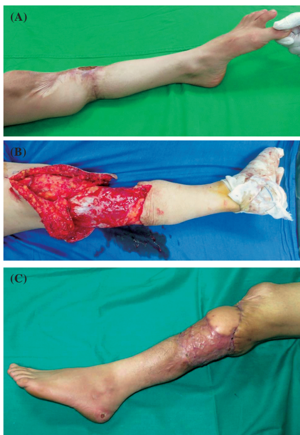
Fig. (7): Case 3: (A) Female patient 40 years old with a long standing trauma to the left leg with recurrent ulceration in the scar and atrophy in the leg, (B) After complete release of the scar and excision of the ulcer, (C) After reconstruction by LD flap in a second stage after AV loop, note replacement of all unstable scars with the muscle tissue.