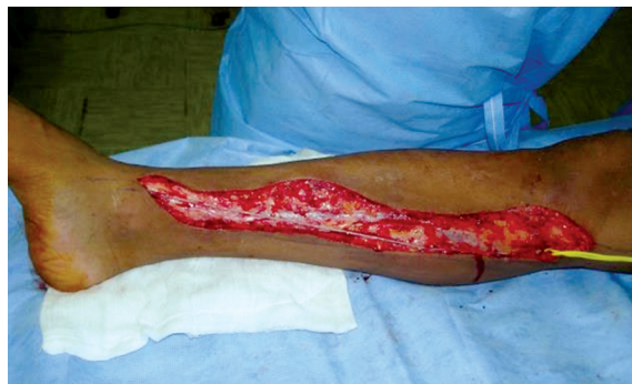
Fig. (1): Incision for harvesting the great saphenous vein.

Clinical and Doppler Monitoring of the A-V loop at skin mark over the site of anastomosis. After 7 days, the second stage was done. A latissimus dorsi myocutaneous free flaps or latissimus-dorsi myocutaneous flap with serratus anterior were harvested. Then the A-V loops were re-explored and divided near the defect. Vascular anastomoses and flap inseting were done. STSG were harvested for coverage of the muscle as in the demonstrated cases (1,2) and in Figs. (5-7) respectively.