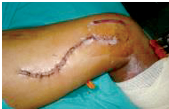
Fig. (4): Show the closed lazy S incision along the medial aspect of the leg.